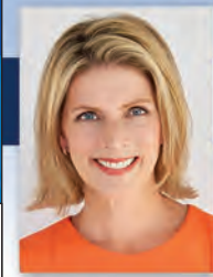
St. Rose Parishioner

For further information, please call the Parish Office.