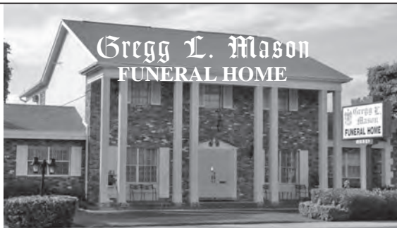
Gregg L. Mason FUNERAL HOME

10936 NORTHEAST 6th AVENUE, MIAMI, FL 33161 glmason@bellsouth.net TEL. 305-757-9000 FAX 305-757-3505